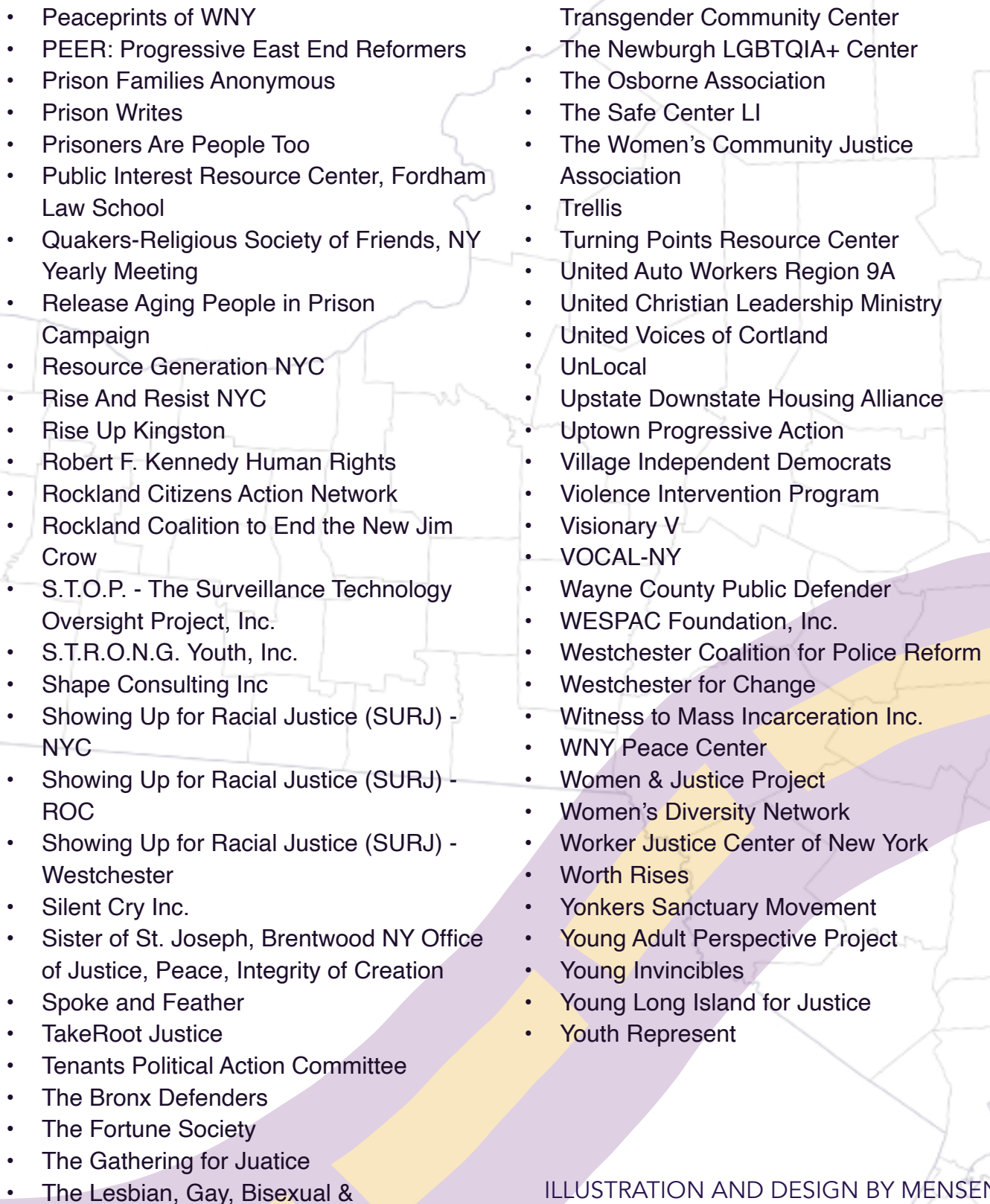
ILLUSTRATION AND DESIGN BY MENSEN // MENSENXOXO.COM